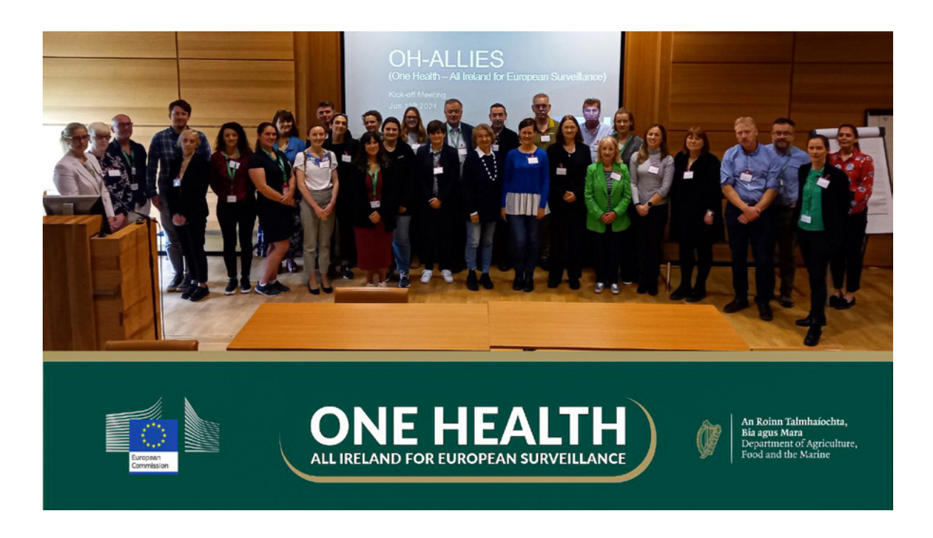
Project collaborators at the One Health: All Ireland for European Surveillance (OH-ALLIES) kick-off meeting

This work will be carried out by a wide-ranging collaborative team at University College Dublin, including colleagues from the UCD School of Veterinary Medicine, University of Galway and at the Department's National Veterinary Laboratory, with input from the Royal College of Physicians of Ireland, The Health Protection and Surveillance Centre, the Irish Equine Centre, and the Agri-Food and Biosciences Institute in Northern Ireland.