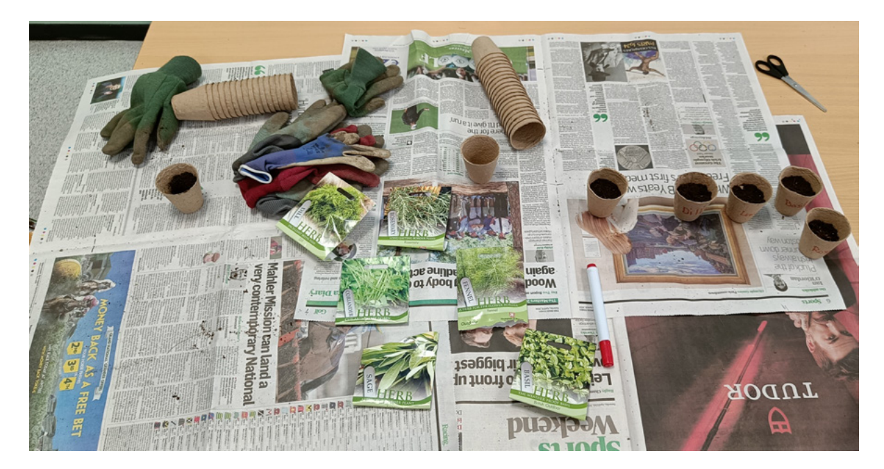
Pet-friendly herb pots were also prepared by staff and students on Earth Day